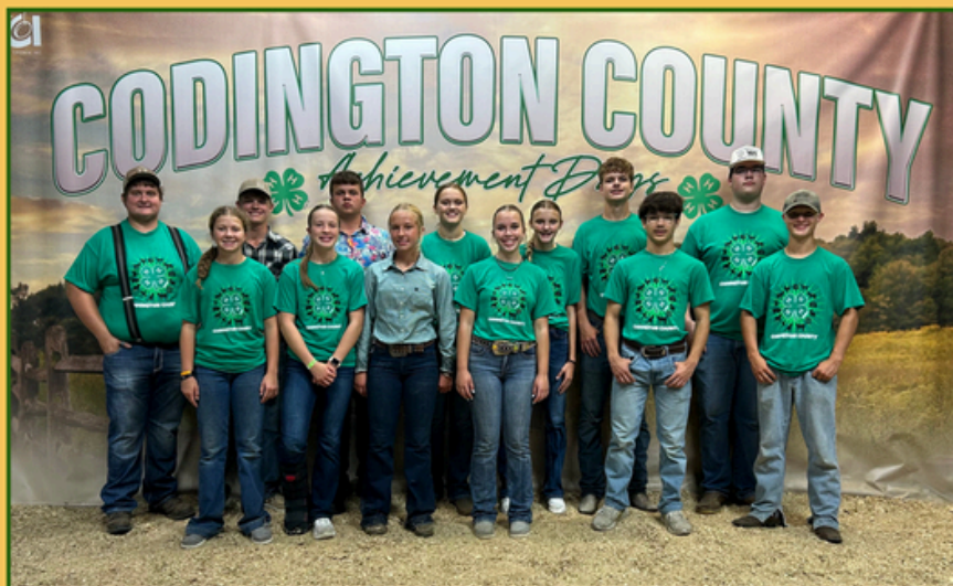
Senior Showmanship Winners