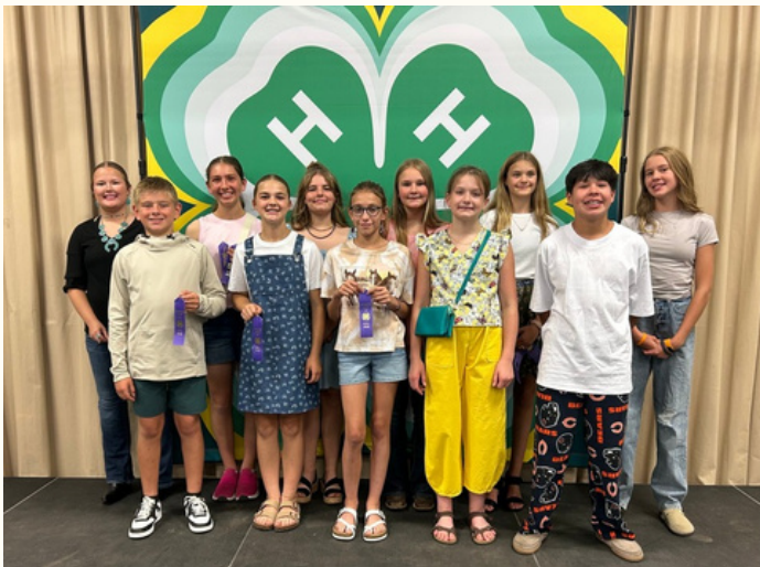
Junior Fashion Revue