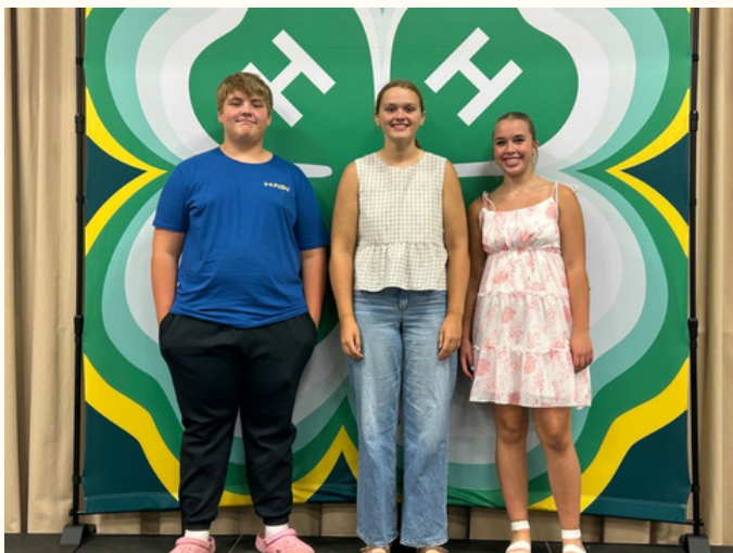
Senior Fashion Revue