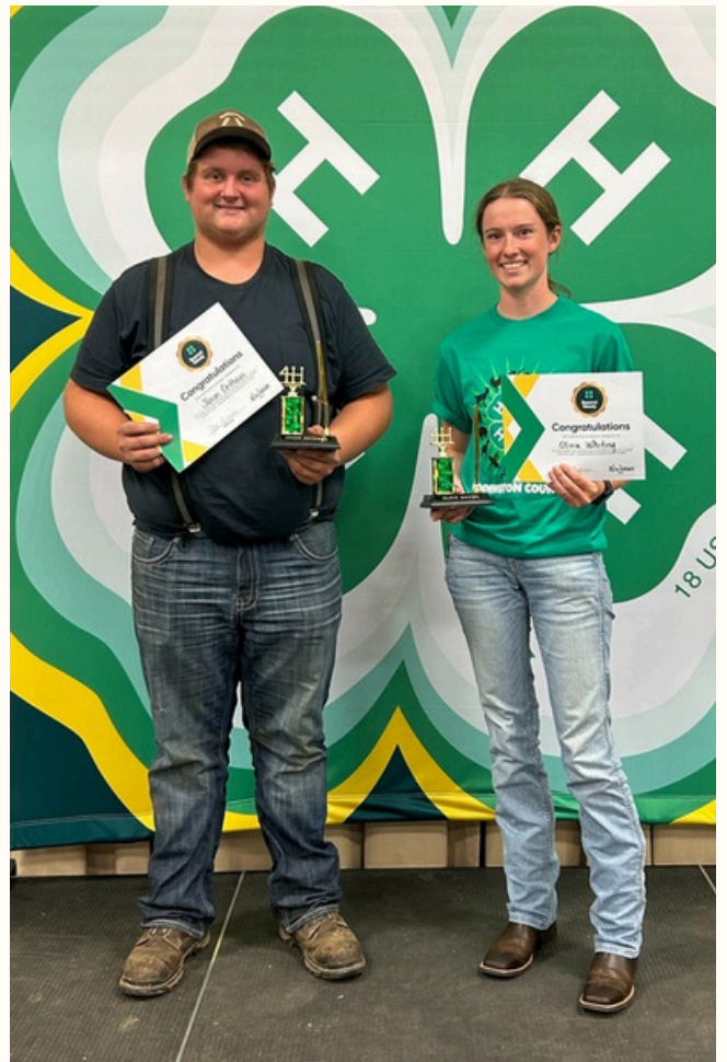
Codington County 2025 Graduates (Not Pictured – Ty Bergh)