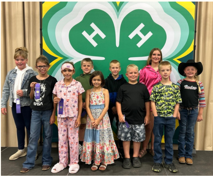
Beginner Fashion Revue