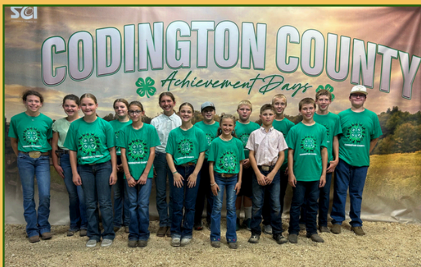
Junior Showmanship Winners