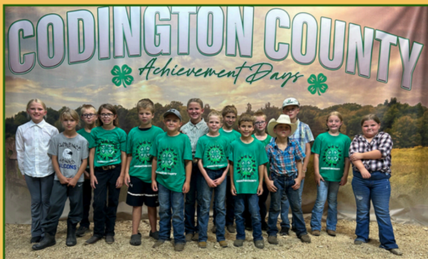
Beginner Showmanship Winners