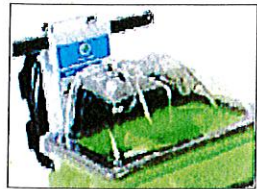
CLEAR VIEW COVER