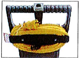
INTEGRATED CORD WRAP