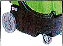
LARGE WHEELS FOR TRANSPORT