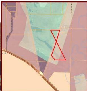
Cotton Slough Addition